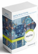
MyCity Smart Priority